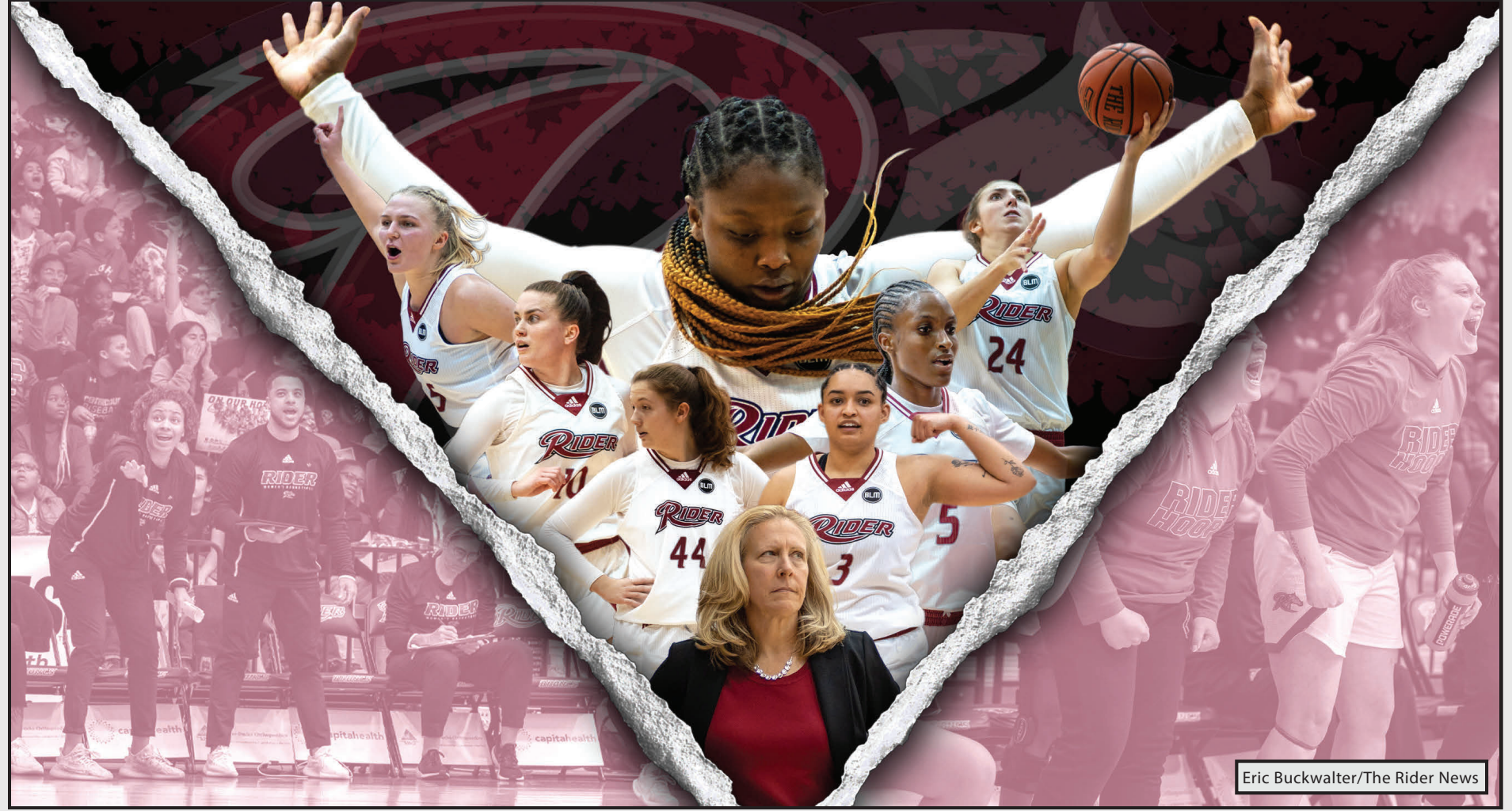
Despite a rocky start to the season, Rider women's basketball has rebounded with a much-improved stretch, winning three of its last five by attacking the paint.