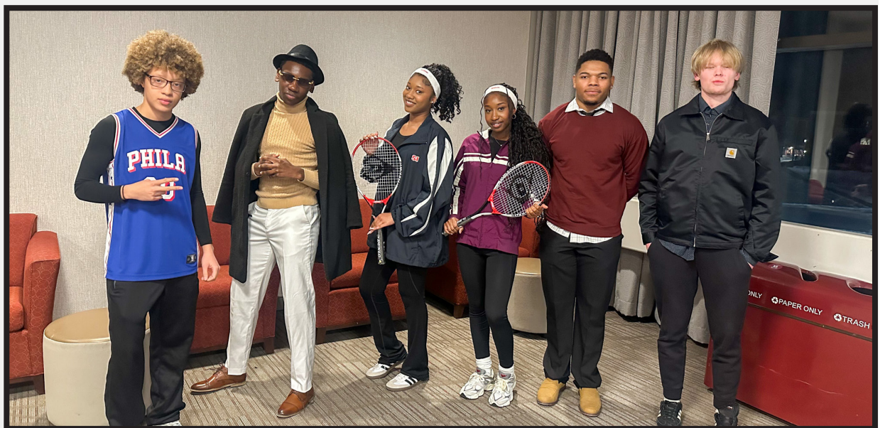
Students show off their outfits inspired by famous Black figures.

group of questions was separated into categories like sports or music.